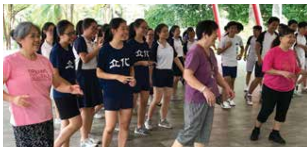
Working out with Boon Lay residents

As organisers and hosts of the Y.LEAD Seminar, RVians also gain valuable experience from conceptualising, planning and organising such a large-scale international seminar.