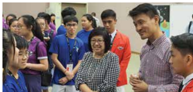
Our students sharing their views with Parliamentary Secretary, Ministry of Culture, Community and Youth, Mr Baey Yam Keng