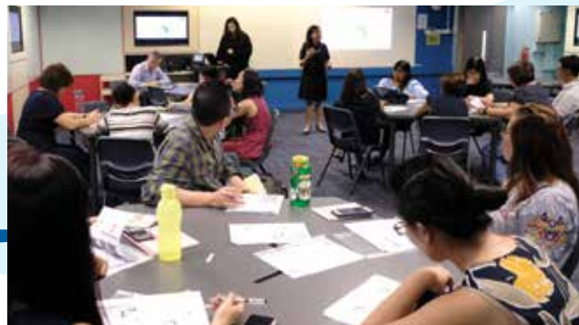
Customised workshop on pedagogical approaches