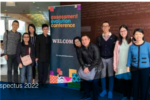
Professional learning for our teachers at the Assessment Evolution Conference in Australia