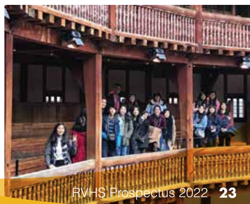
Visiting the reconstructed Globe Theatre