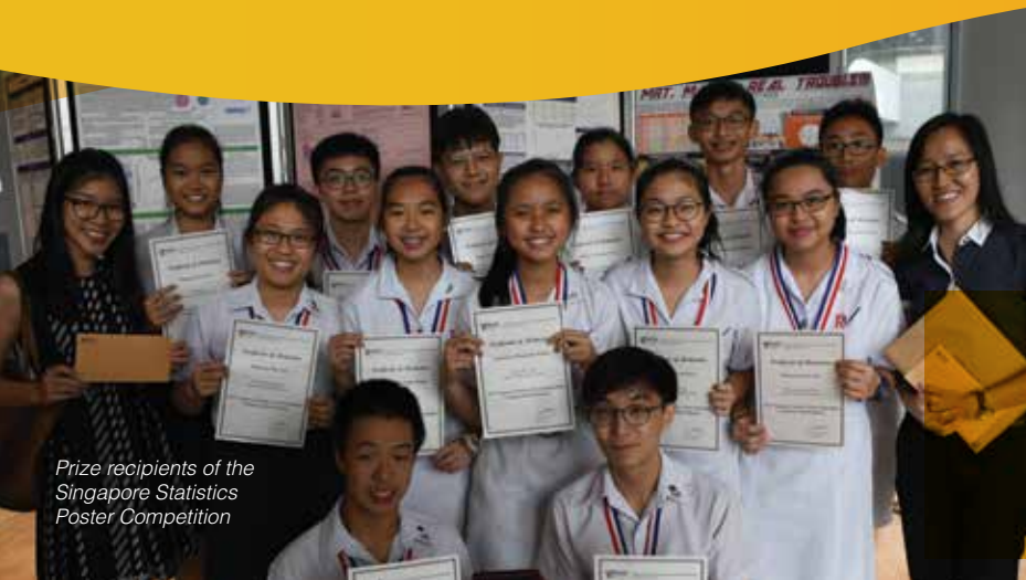
Prize recipients of the Singapore Statistics Poster Competition