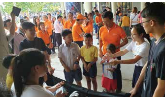
Our students facilitating an activity for Minister for Education Mr Ong Ye Kung and game participants at the Sharity Day event

In addition, to develop leaders of distinction for Singapore, the leadership development component of the curriculum incorporates leadership skills which are grounded in sound moral values. It is developmental and every RVian will have the opportunity to take up the mantle of leadership.