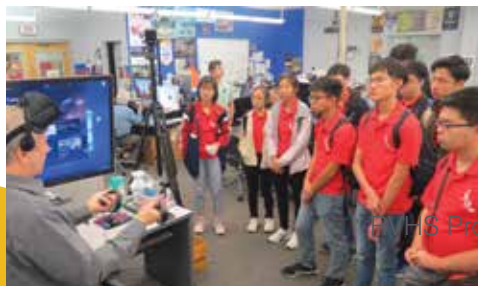
SLA students attending an augmented reality workshop at the Media Design Lab at Bergen County Academies