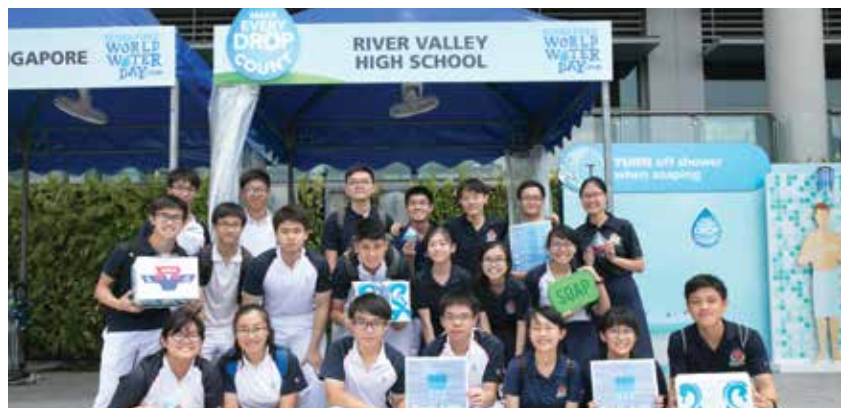
The TESLA team who worked hard to make their activity booth at the Singapore World Water Day a success!