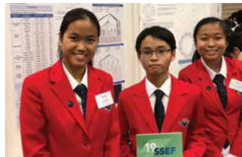
Our students' project was awarded Merit at the Singapore Science and Engineering Fair 2019

Students have the opportunity to hone their leadership skills through leading, planning and implementing events such as the River Valley Mathematics Challenge, the Mathematics department's key student-centered event organised for primary school students.