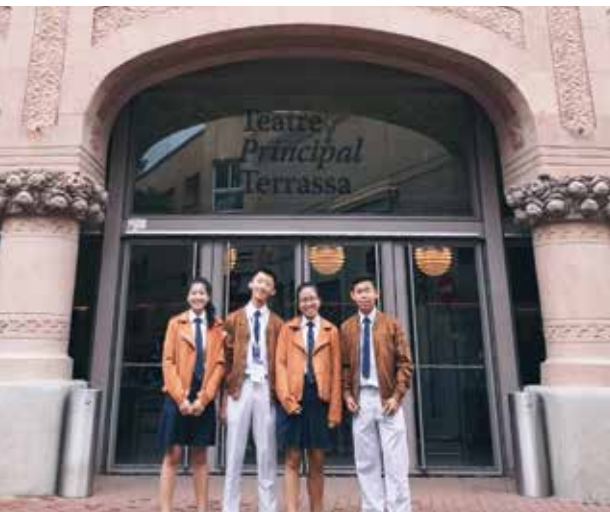
At the Global Sustainability Conference in Spain

Students conduct ecological fieldwork and environmental studies investigation, and work under the guidance of researchers and lecturers at institutes of higher learning. As part of the talent management of the academy, students can also get to participate and compete in international student conferences and local workshops.