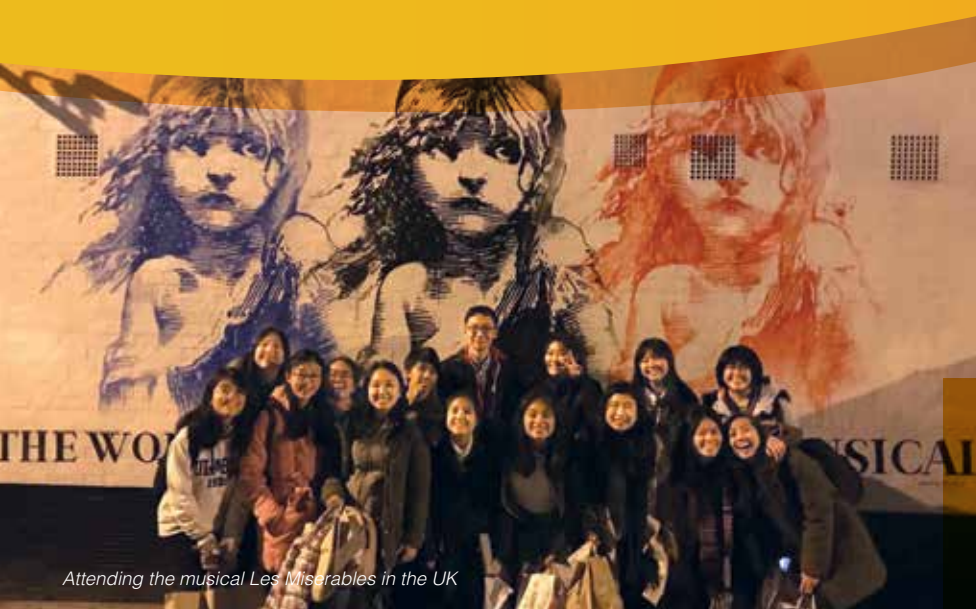
Attending the musical Les Misérables in the UK