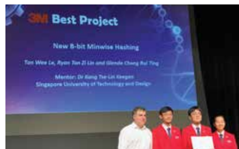
Science Mentorship Programme - one of our teams received the 3M Best Project Award