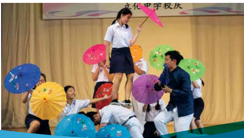
Walking down memory lane during our 63 rd School Anniversary concert

多年来，立化中学在教育方面开拓了不少新领域。1979年成为特选中学、1994年成为自治中学，并于2006年开办六年综合课程。立化学子无论是在学术或非学术领域都有不俗的表现，在国际舞台绽放光芒。