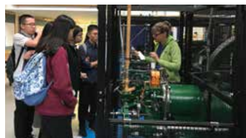
Learning about instruments used in the Department of Engineering at the University of Cambridge