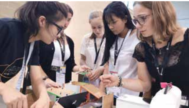
Attending a workshop at the Global Sustainability Conference

The Eco-Sustainability Leadership Academy (TESLA) imbues in students a passion for the environment, and to be leaders with the commitment and skills to drive positive and transformative change for a sustainable future. The academy provides opportunities to cultivate environmental consciousness, leadership competencies and knowledge of current eco-sustainability issues.