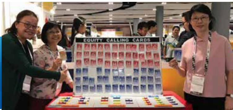
Sharing RV's very own "Equity Calling Cards" with visitors at MOE ExCEL FEST