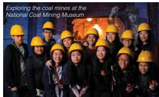
Exploring the coal mines at the National Coal Mining Museum

The programmes organised by the HSSLA include seminars and speaker series where participants acquire a multi-disciplinary perspective on issues surrounding the hyper-globalisation of modernity. Collaborations with external agencies, complemented by both local and overseas experiential learning journeys, talks and conferences with academics from institutions of higher learning provide additional platforms for HSSLA students to be the best that RVHS can offer humanity.