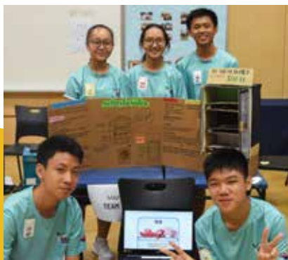
RV participants at #startathon Junior

With the opportunity to participate in these programmes, SLA members build an extensive portfolio which enables them to apply for prestigious scholarships and academic awards in research areas or in the fields of science and engineering.