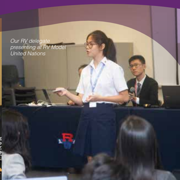
Our RV delegate presenting at RV Model United Nations