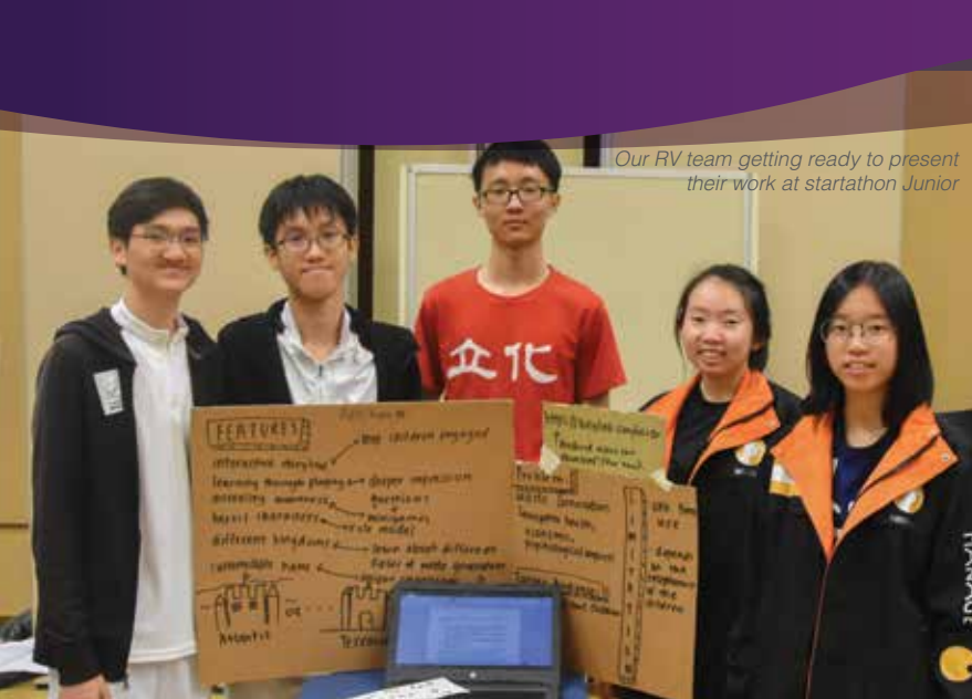
Our RV team getting ready to present their work at startathon Junior