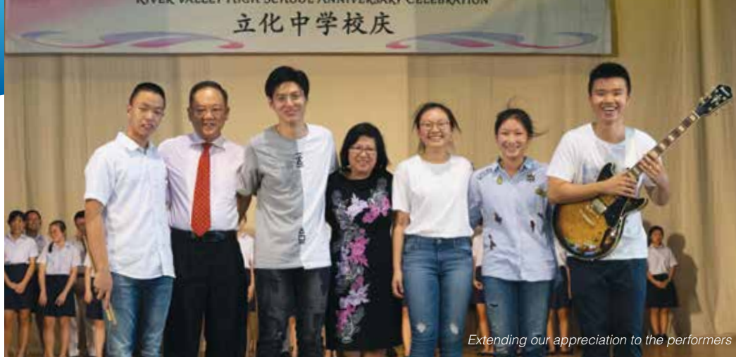
Extending our appreciation to the performers

Founded in 1956, River Valley High School (RVHS) is a forward-looking educational institution steeped in Chinese culture and values. For more than 60 years, RVHS has nurtured generations of Singaporeans who serve and lead in the community and nation.